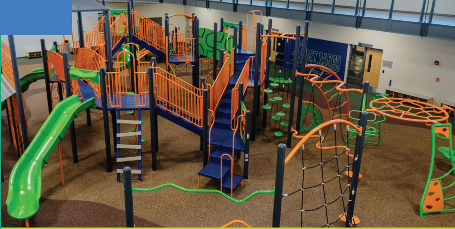
INDOOR PLAYGROUND CONCEPT