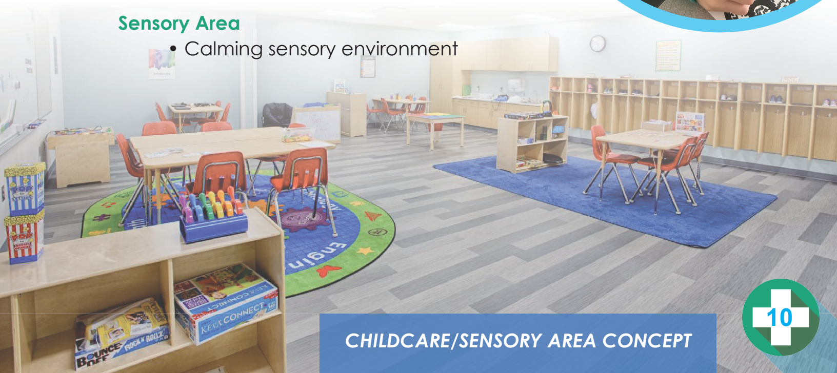
CHILDCARE/SENSORY AREA CONCEPT